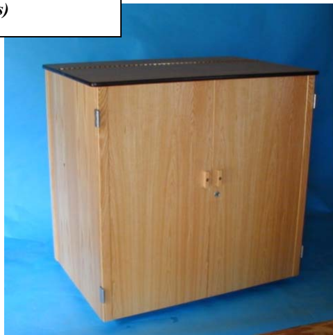
2002 Lectern with presenter-side, lid closed. (Note: Magnet on pull handles)