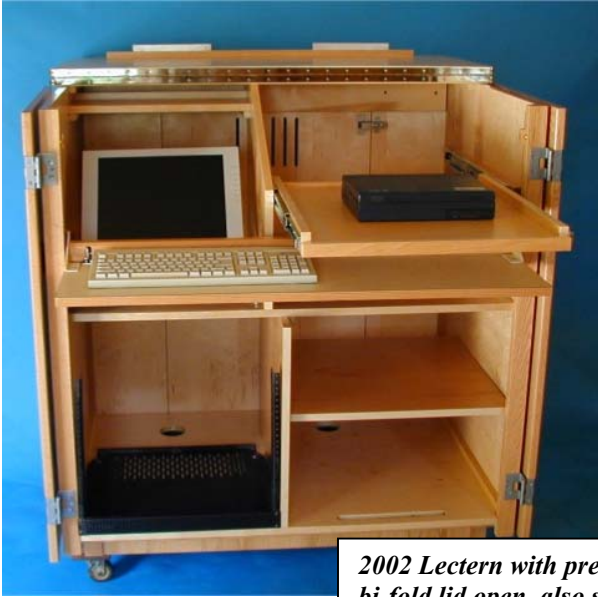
2002 Lectern with presenter-side wrap around doors and bi-fold lid open, also shown, adjustable keyboard shelf, pull out shelf or work surface, well for monitor and rack cabinet

The Hogg 2000 Series (and 3000 Series) is the most secure lectern of the Hogg Family of multimedia cabinets. The 2000 comes in three basic sizes and incorporates a flat hinged cover lid which folds back on itself to expose the work surface. When closed, the lid secures the monitor and control panel from unwanted use and vandalism and allows the lectern to be used as a standard non-electronic podium. The wrap-around 270° presenter-side door(s) captures the cover lid and secures the lower section of the cabinet with one deadbolt lock. Like the 3000 Series, the 2000 incorporates an adjustable keyboard desk and monitor shelf for ease of operation. The 2000 lectern is ideal for those applications where an extra increment of security is required, particularly in rooms, which are not always secured or attended.